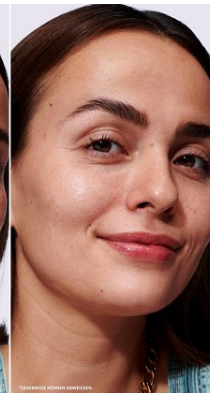
UNRETUSCHIERTES ERGEBNIS NACH 4 WOCHEN