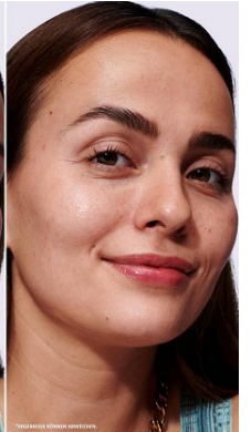
UNRETUSCHIERTES ERGEBNIS NACH 4 WOCHEN